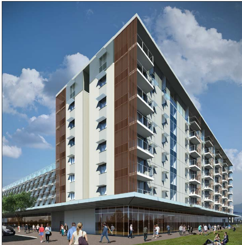
Option 1: Not Supported