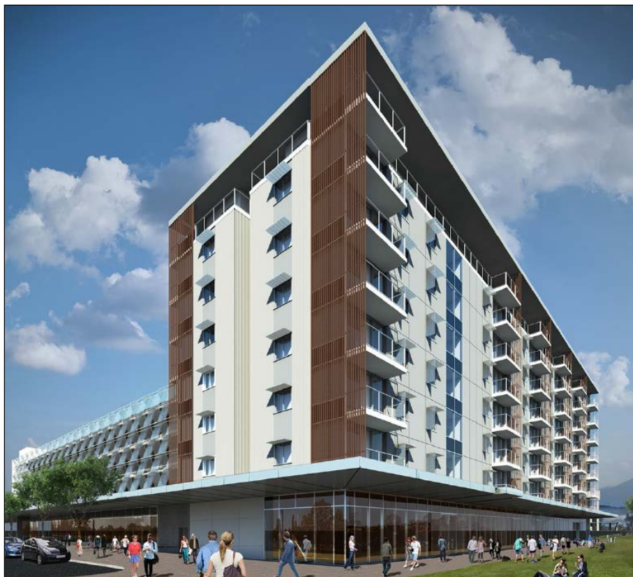
Option 2: Improvement but Not Supported